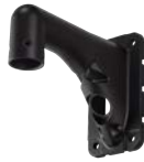
WV-QWL501-B Mount Bracket